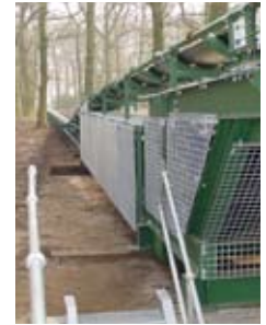
StedFAST conveyor protection products

Davis Derby continued to develop new products for the mining industry but also set about to diversify into new markets. Examples include inductive charging systems for electric vehicles, radio frequency identification systems to automatically track the position of personnel vehicles and other assets.