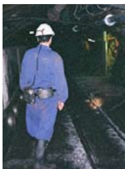
MineWATCH RFID Systems

1972 witnessed the launch of the two products that were to be very significant to the future of Davis Derby. These were the DIS 4 loudspeaker Communication System and the Sivad MK II Coal Face Signalling and Communication System. The company continued to expand during the next decade and by 1980 some 1200 Sivad MK II Systems had been sold worldwide. The British Coal industry was in phase of considerable investment throughout the late 1970's. The company developed a new Telemetry Unit in 1978, which was destined to become one of the Company's most successful products.