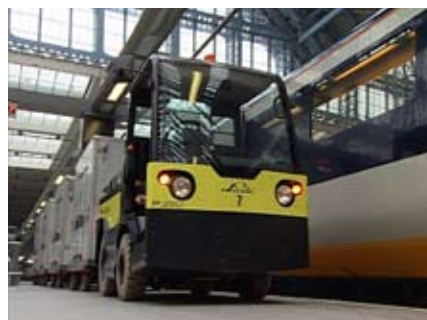
TruckLOG in action at St Pancras Station

The company entered into an agreement with Texas Instruments to develop a radio Frequency Identification (RFID) system to track miners and vehicles in mines, significant orders for this new system were won in the UK for use in mines and on oil and gas platforms, systems were also sold in China.